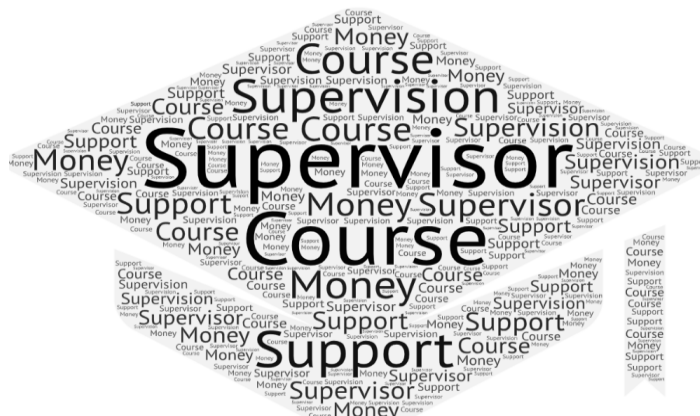
Figure 3. Cloud of words

From the above, we can infer that the presence of the supervisor is important in thesis development and therefore there is a significant relationship between the supervisor and thesis development (Bayona, 2018) besides gratitude (Howells et al., 2017). A cloud of words (Figure 3) shows the need for improvements based on the perception of the respondents, who highlight the need for a supervisor, improve the supervision process and courses related to thesis development.