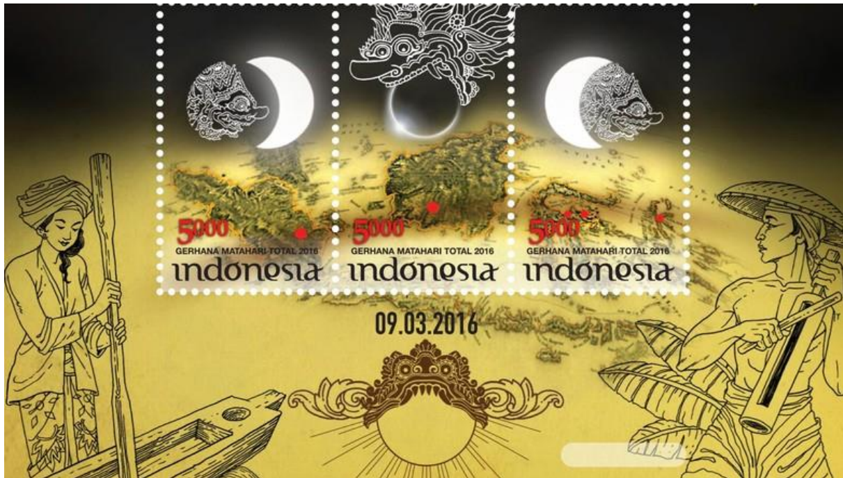
Figure 2. The special edition stamp issued by the Indonesian Postal Service in observance of the 2016 solar eclipse (source: http://www.posindonesia.co.id/index.php/berita/154-penerbitan-prangko-seri-gerhana-matahari-total-2016 ; retrieved on June 2016).

ignorance. Such a myth has been long lived among Javanese people, and thus, solar eclipse—particularly total solar eclipse—is widely considered an extraordinary event, during which people observe several taboos (Wiramihardja, 2014; Keeler, 1988; Kleden-Probonegoro, 2008). They believed that pregnant women and children should stay indoor to avoid Batara Kala's anger. They also believed that several activities, some of which are eating, looking at the sun, constructing a house/building, and celebrating a marriage, should not be done. Moreover, they were recommended to take a bath and purify their house and heirlooms.