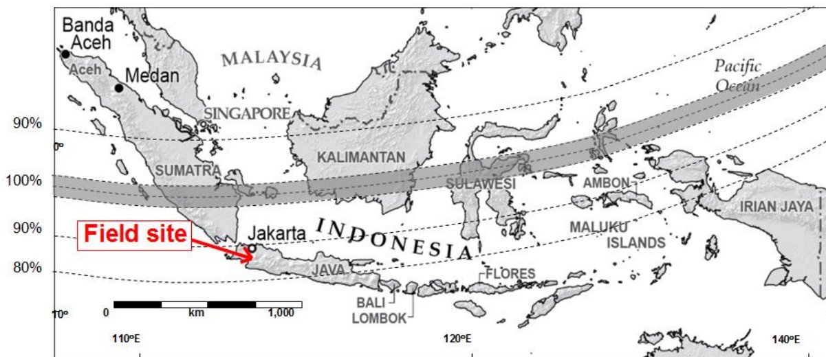
Figure 1. Path of the total solar eclipse over Indonesia on March 9, 2016. The field site was located at Universitas Pendidikan Indonesia, Bandung, about 550 km from the central axis of the eclipse totality, and experienced a 88,76 % eclipse at 07:21 local time (LT) (00:21 Universal Time). The path of solar eclipse was adopted from BMKG Indonesia.