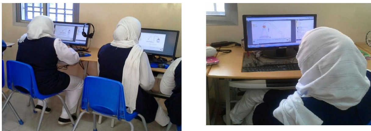
Figure 2. Sample of students working in the virtual lab program.

For the experimental group (with 35 students), the chemistry experiments were taught to students using Crocodile virtual lab. This software stimulates real laboratory where the students carried out chemistry experiments virtually. Each computer uploaded with a large number of readymade reactions. Animations provided to the software units in different languages. Arabic version used since the Arabic is the language of instruction for science subjects in public schools in Oman. The experiment lasted for 12 weeks, during two lessons per day. Each student in the experiment group worked in separate PC to view and interact with different animations related to different topics that belonged to the chapters in the 9 th grade science textbook (Chemistry Unit). Figure 3 shows examples of students working in the experiments.