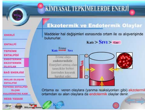
Figure 1. Phase Changes Process (Demirdağ & Kartal, 2007)

With the help of CAE, students will be able to observe natural events that are unobservable because of being too big, too small, too fast, too slow or too complex (Singer et al., 2006). CAE is very important in chemistry education because it enables students to understand and imagine processes such as chemical and physical processes easily (Demirdağ, 2007). For instance, an animation of phase changes process is given in Figure1.