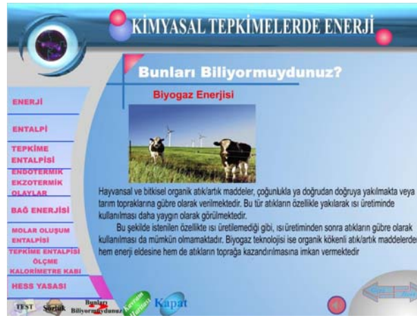
Figure 5. Material's "Do You Know These?" Section

In "Do You Know These" section, some samples from daily life about thermo chemistry were given to the students (Figure5).