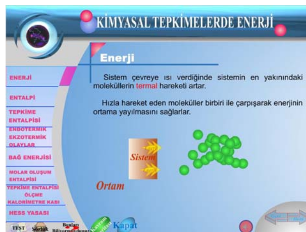
Figure 2. A View of Material Prepared

Application process had 8 hours for each group. TM was applied to the CG. CAE method was applied to EG by using CAE material in computer lab. The subtopics; Energy, Enthalpy, Reaction Enthalpy, Endothermic Exothermic Events, Bond Energy, Molar Formation Enthalpy, Calorimeter Container, Hess Rules were instructed in the way of TM. Also, the same subtopics were instructed to the EG by using CAE material. Some questions at the subtopics were asked to the students to provide meaningful learning. Graphs, animations, concept maps, figures, interactions were used in the CAE material. To take students' attention, some samples from daily life related to thermo chemistry were used.